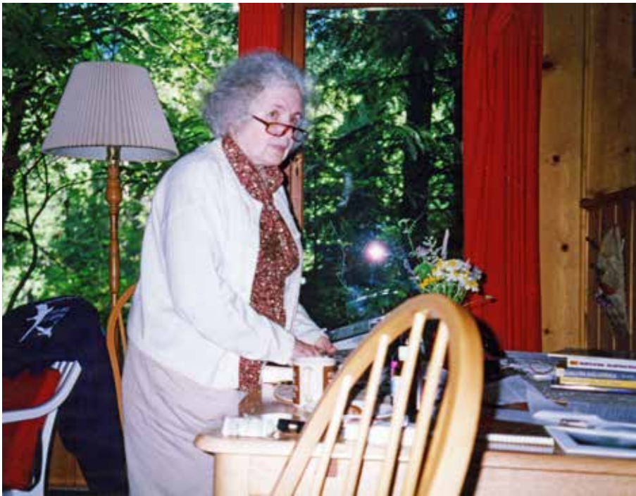
Grace Paley in her cabin at Cedarwood Lodge, 1995