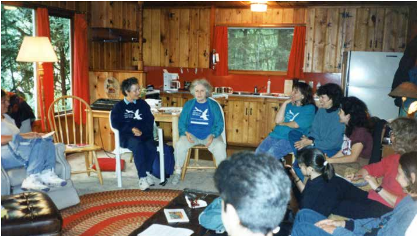
Grace Paley's class, meeting in what was always referred to as Grace's Cabin (Big River), at Cedarwood Lodge, 1995