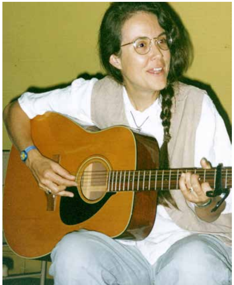
Left: Naomi Shihab Nye, singing as part of her evening reading, 1995