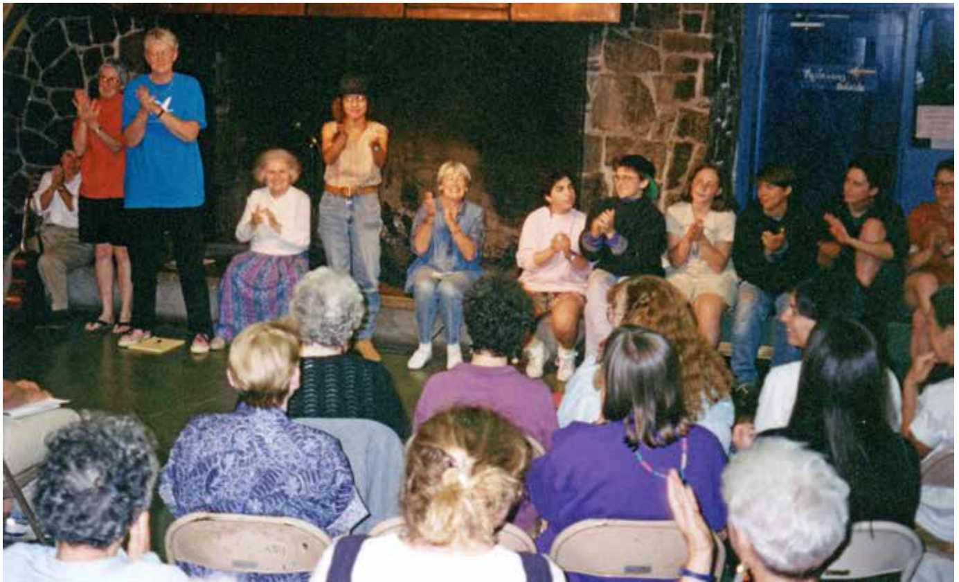
Final night, teachers and staff applauding the participants for their hard work, courage, and good humor, 1995