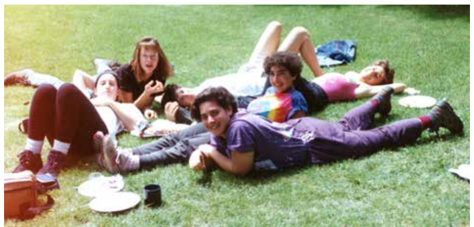
Right: Staff sprawl on the lawn, 1995